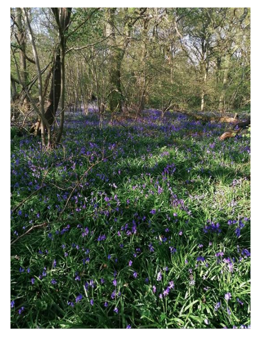
Please respect the plants, birds and animals when you go.

Many thanks to Martin Gibson for opening up Thicketts Wood for walking and exploring. The bluebells are spectacular!