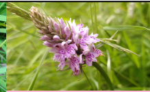
Common Spotted Orchid